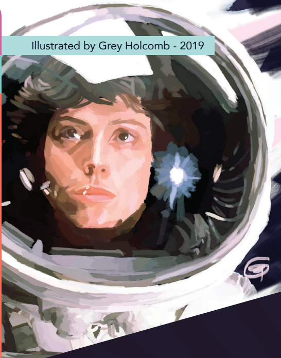
Illustrated by Grey Holcomb - 2019

Media & Communication Arts (MACA) is a diverse program here at Macomb Community College. We train students using the latest industry-standard software, techniques, and skills to prepare them for a wide range of careers in design, illustration, interactivity, web, 3D, photography, video, and motion graphics.